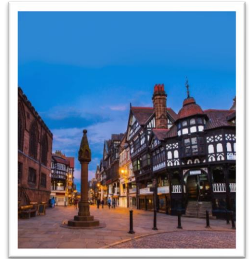
Chester's Historic Center

Stop at Bluebell Cottage Nursery. (19 miles, 25 minutes). We'll have tea and a tour of the garden for about 90 minutes. At 3:30 we depart for the hotel in Chester with an expected arrival at 4:00. You're free to explore Chester this afternoon. We'll meet for a welcome pint at 6:30, followed by dinner nearby at 7:00. Overnight Chester (TD)