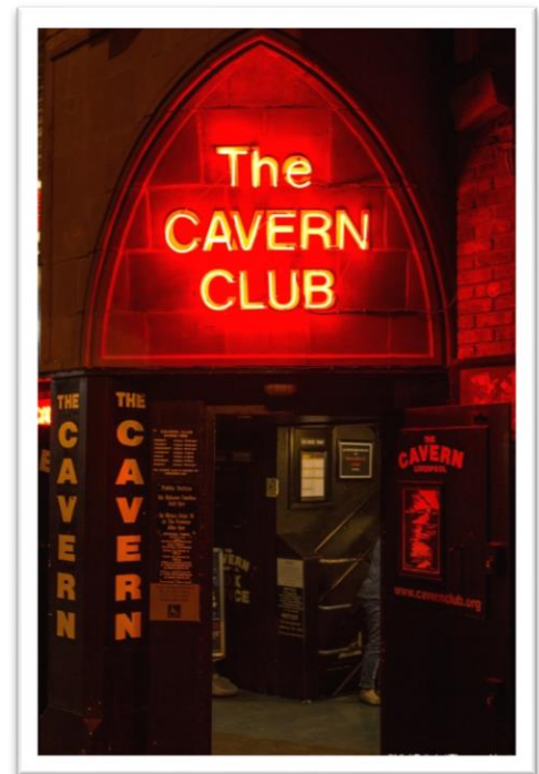
It all started here...

Initial deposit due is $1500 per person. Balance is due January 31 st , 2019. Airfare is not included, but assistance will be provided to book flights to meet the group in Manchester. Estimated airfare is under $1200 per person.