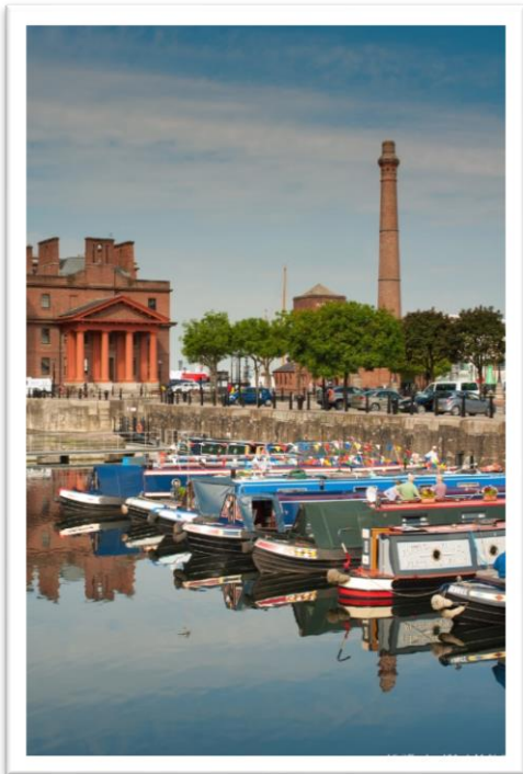
Canal Boats-Liverpool Waterfront

We've dedicated today to Liverpool and the Fab Four. We'll have a guide join us for a complete Beatles Tour. In the afternoon, after we take the ferry cross the Mersey, you'll have time to see the waterfront with options for the Beatles or Titanic Museum. Overnight Liverpool (B)